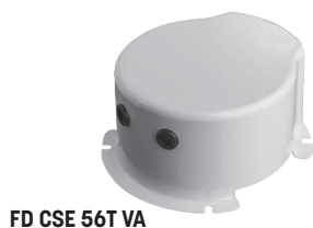
FD CSE 56T VA